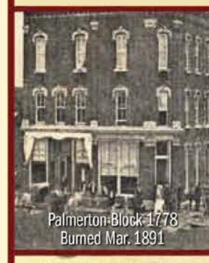
Grand River Ave. - 1878